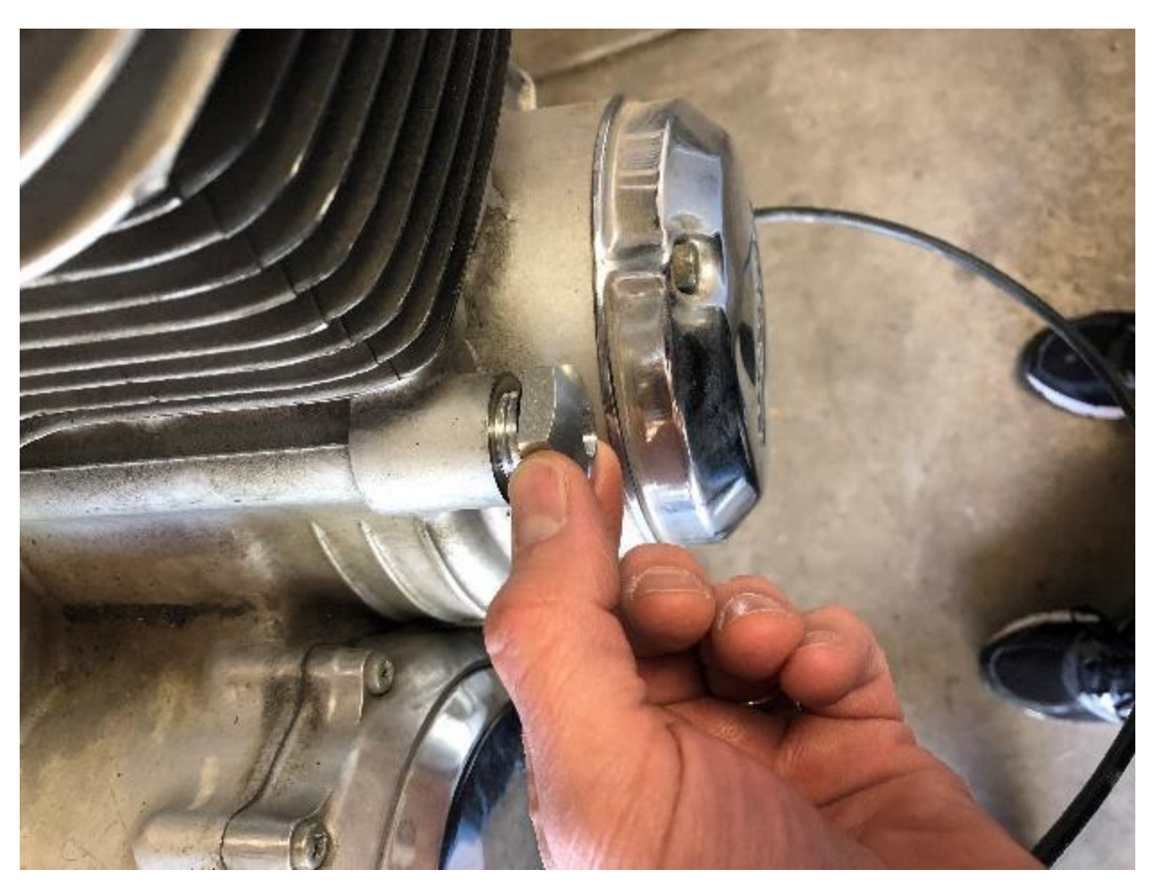
Figure 3Thread adapter into oil galley