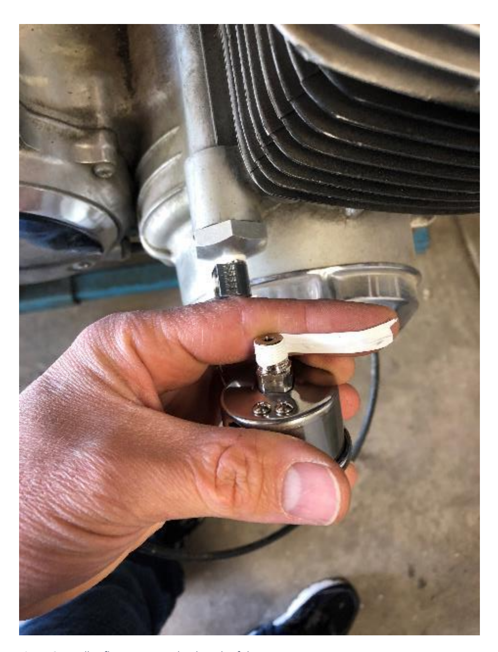
Figure 8 Install Teflon tape onto the threads of the gauge