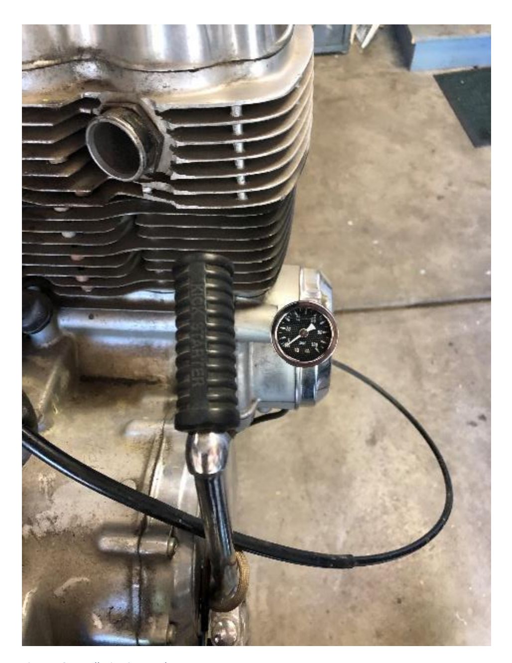
Figure 13 Installation is complete