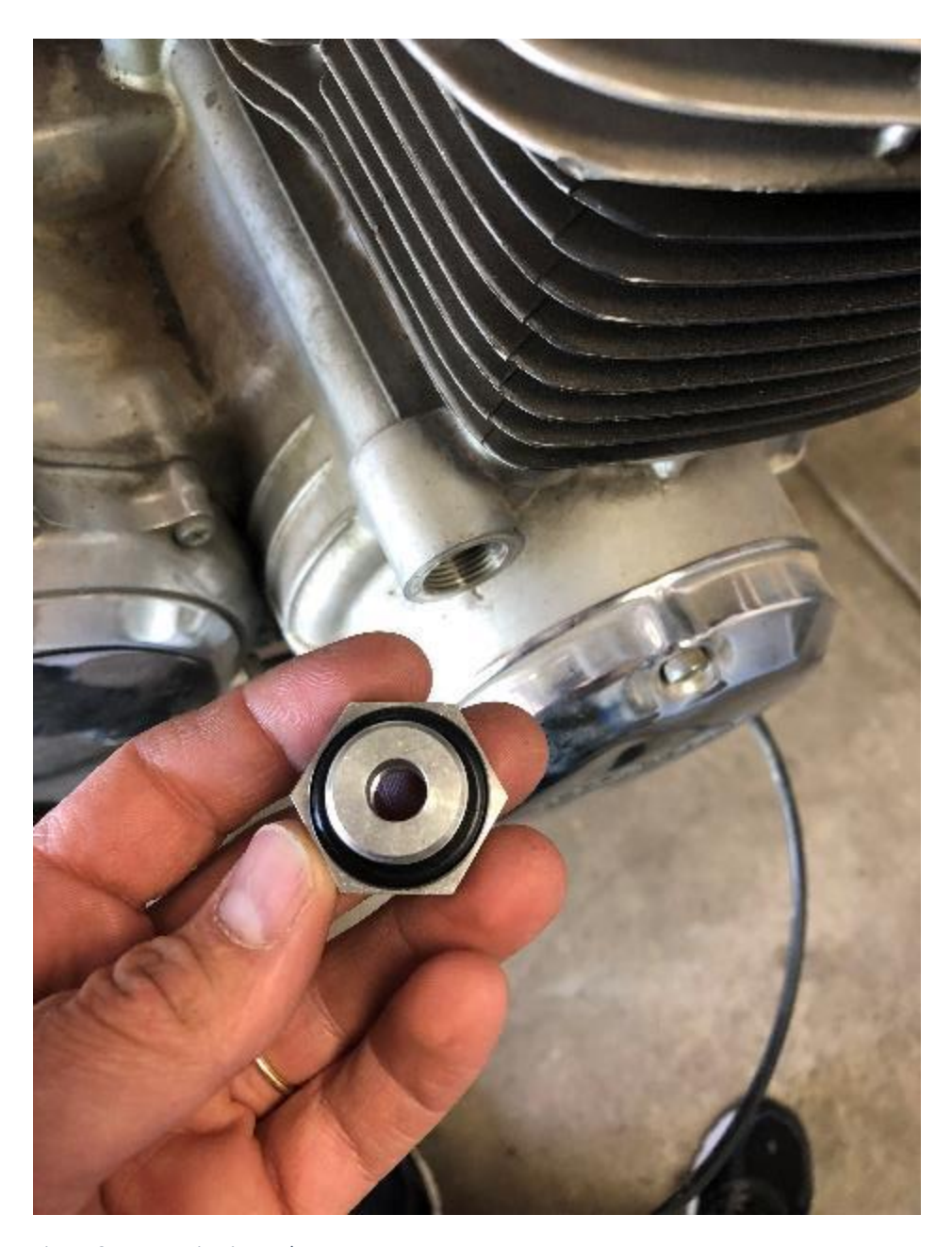
Figure 2 Insert o-ring into adapter