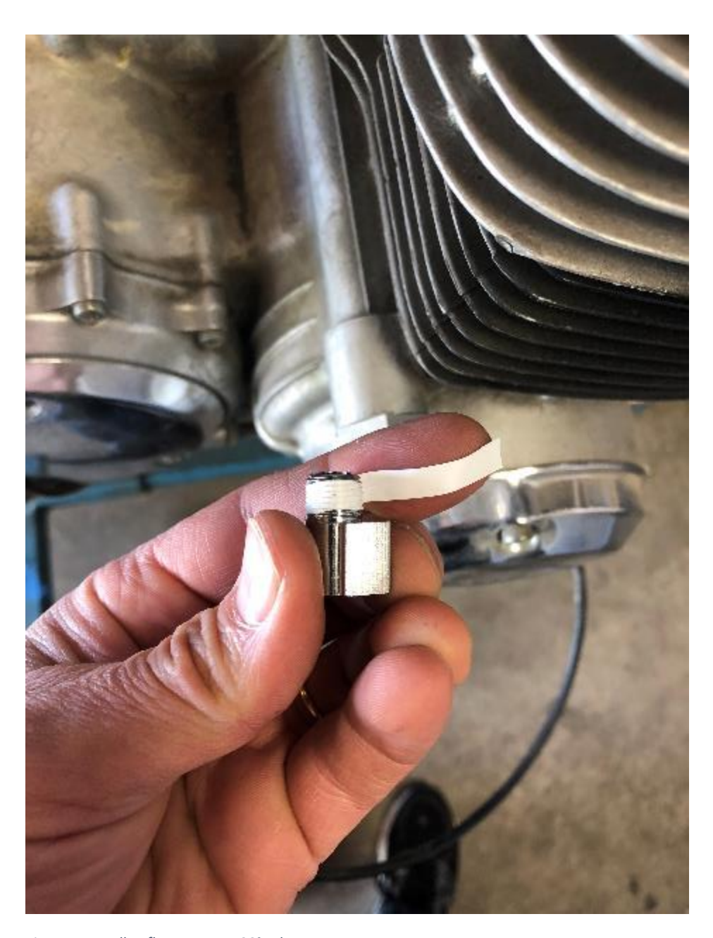
Figure 5 Install Teflon tap onto 90° adapter