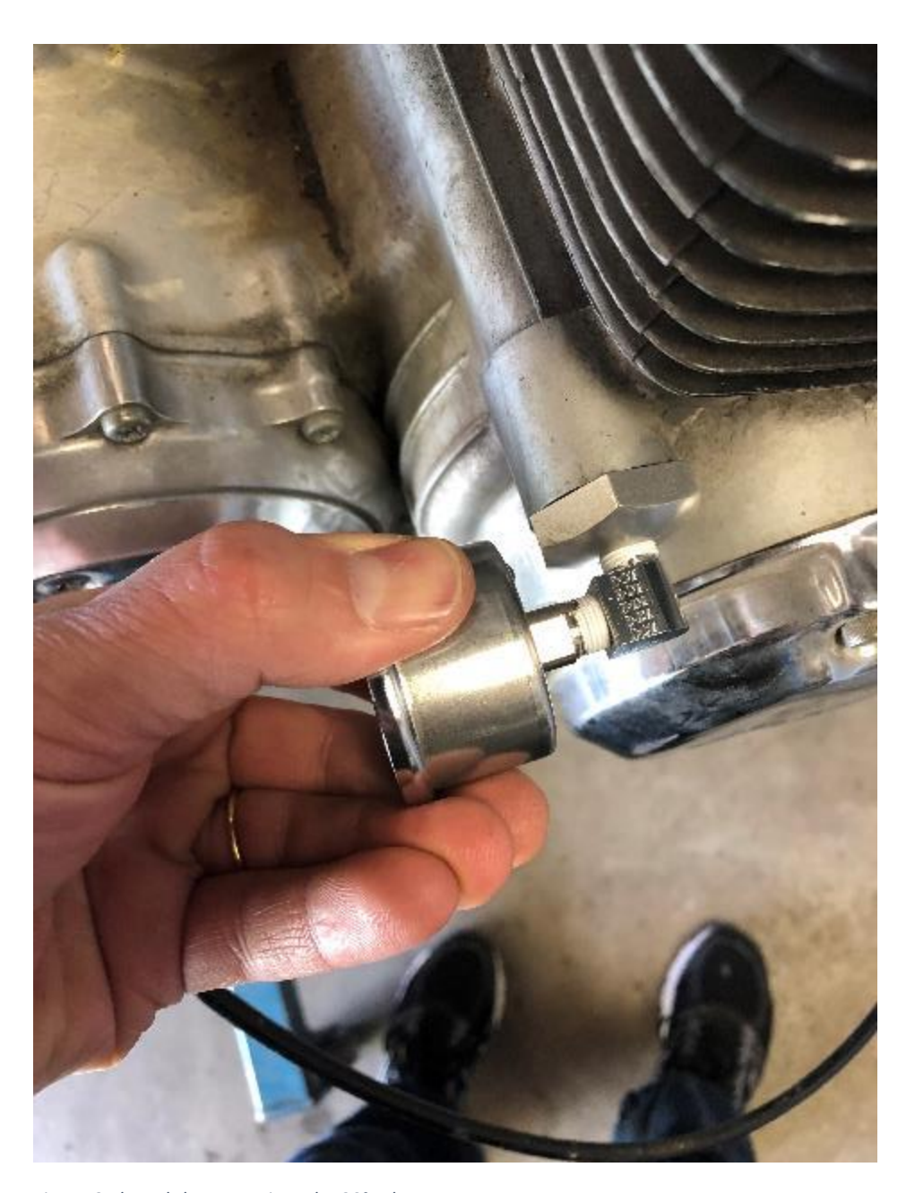
Figure 9 Thread the gauge into the 90° adapter