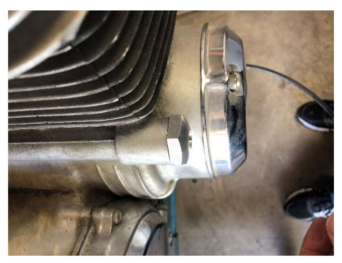
Figure 4Tighten adapter by hand until tight