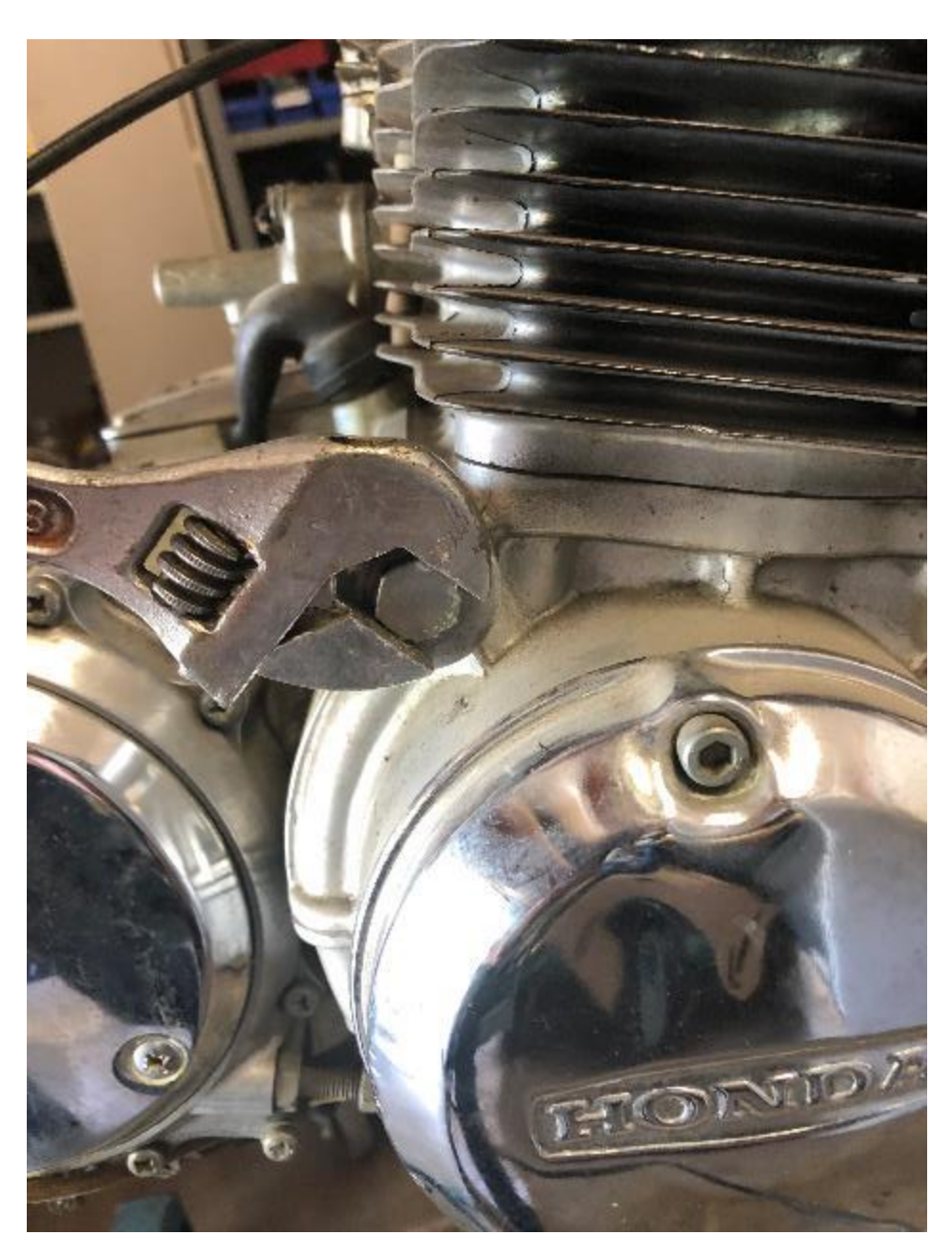
Figure 1 Remove oil galley plug