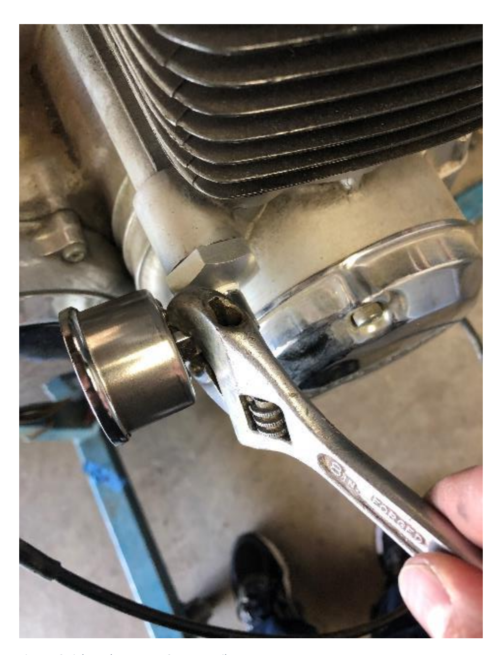
Figure 10 Tighten the gauge 1-2 turns, until snug