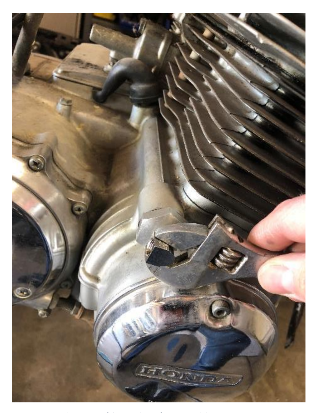
Figure 7 Position the opening of the 90° adaptor facing toward the rear