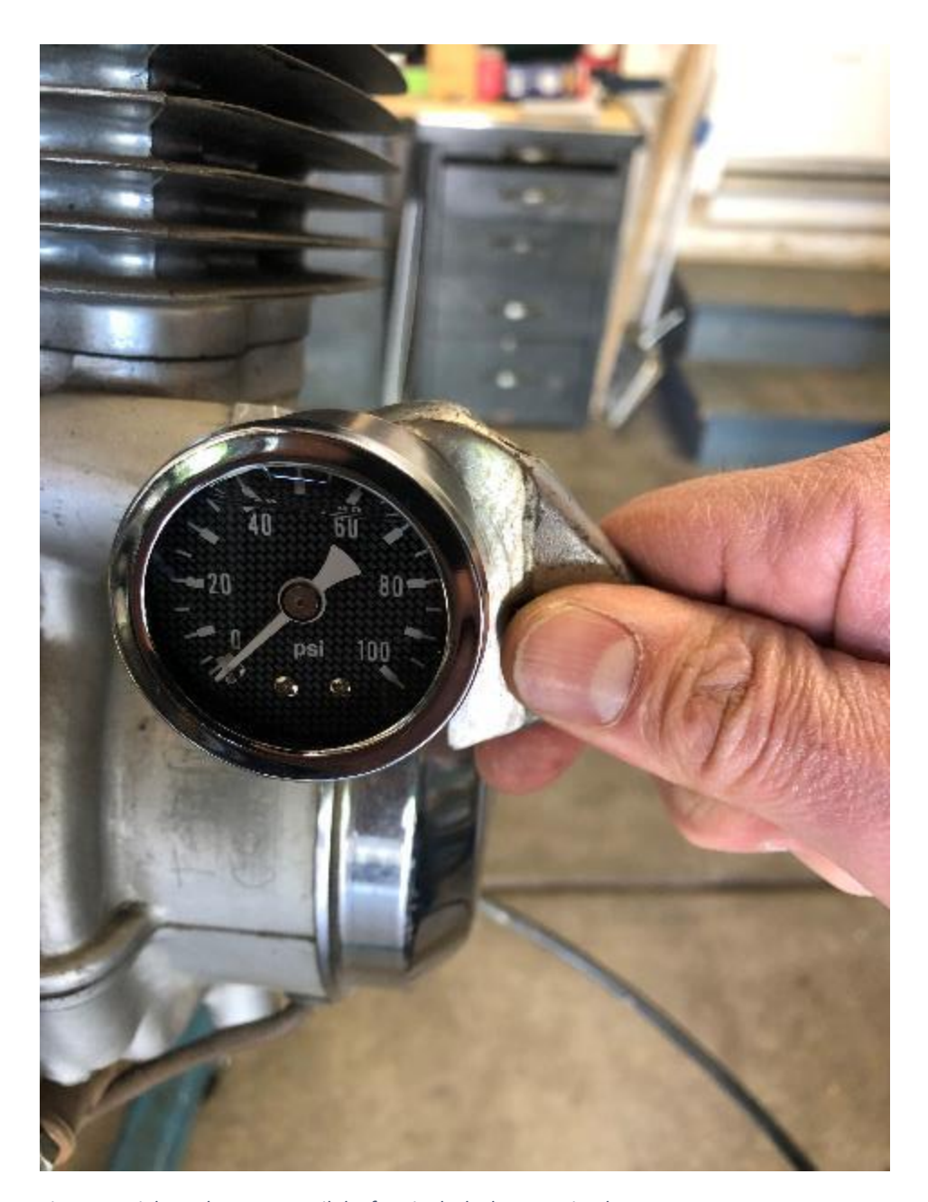
Figure 11 Tighten the gauge until the face is clocked appropriately